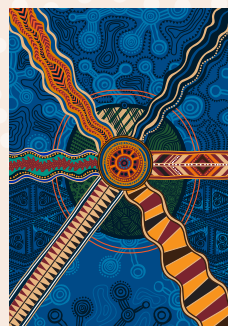
Making Tracks artwork produced by Gilimbaa for Queensland Health.

Queensland Health and the Queensland Aboriginal and Islander Health Council (QAIHC), the peak body representing Aboriginal and Torres Strait Islander Community Controlled Health Organisations (ATSICCHOs) in Queensland, acknowledge the Traditional and Cultural Custodians of the lands, waters and seas across Queensland, pay our respects to Elders past and present, and recognise the role of current and emerging leaders in shaping a better health system. We recognise the First Nations peoples in Queensland are both Aboriginal peoples and Torres Strait Islander peoples, and support the cultural knowledge, determination and commitment of Aboriginal and Torres Strait Islander communities in caring for the health and wellbeing of our peoples for millennia.